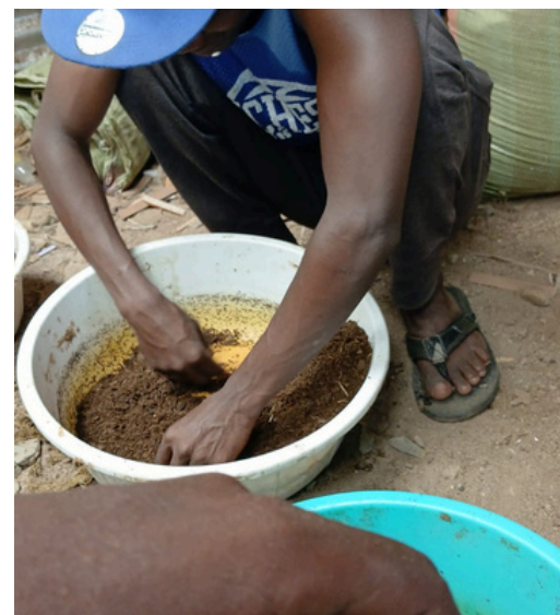
participants separating the prepuae from the organic manure