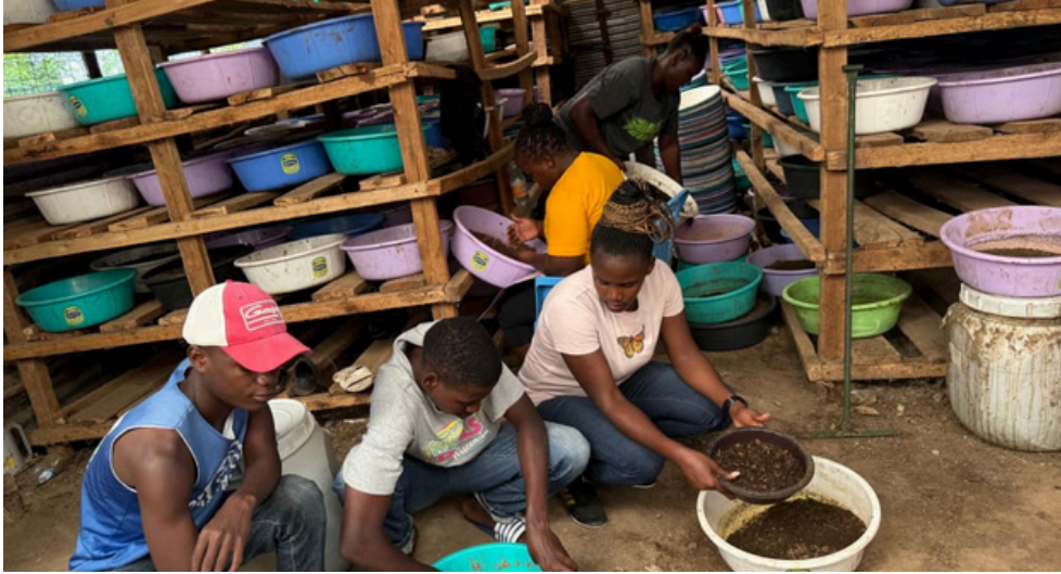
participants separating the prepuae from the organic manure

“When we transform waste, we unlock opportunity.” — Eco Alchemy