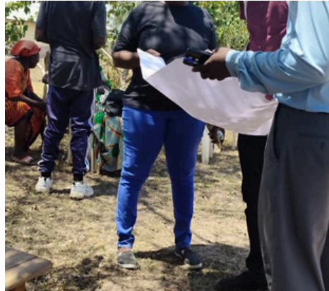
farmers discussing the BSF life cycle

This quarter, we introduced them to Black Soldier Fly (BSF) technology — a solution that tackles both.