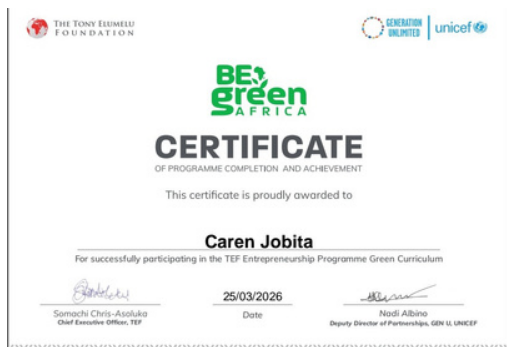
Be Green Certificate completion

This achievement is more than a certificate; it's a seed that will continue to grow through the knowledge, tools, and improved training we now bring to our communities.