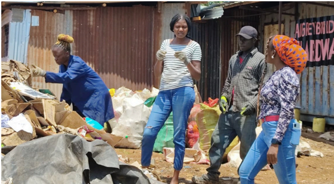
one-on-one mentorship at Diana's waste recovery facility